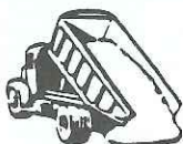
SAND & GRAVEL